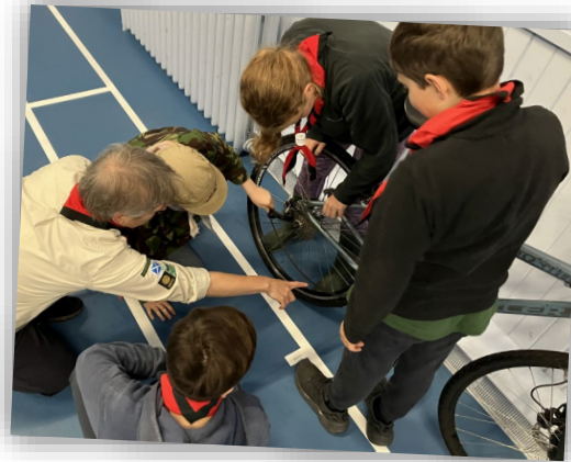
Creating upskilling and social benefit opportunities