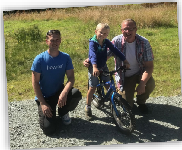
Providing free bicycles to support local families cycling

Funding currently being sought to continue and expand the reCycle project